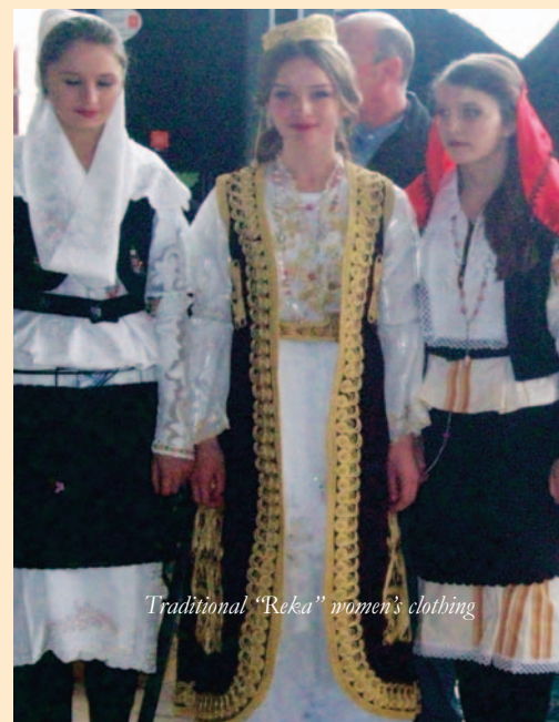
Traditional “Reka” women’s clothing