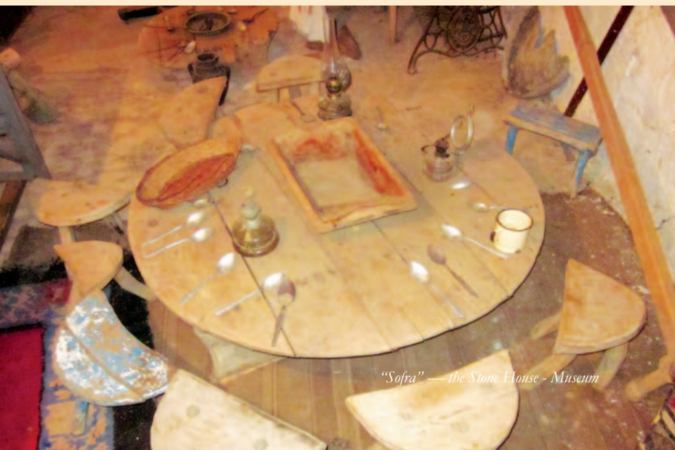
“Sofra” — the Stone House - Museum