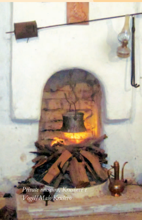
Privatno muzeum, Kruševë e Vogël/Malo Krušero

A traditional female occupation in this area is the production of costumes woven on the loom and decorated with different colors. It is a handicraft that still exists, and it creates the potential for an attractive product that has developed from the skilled handiwork of women from Klinë/Klina municipality.